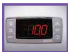
Adjustable Digital Temperature Display