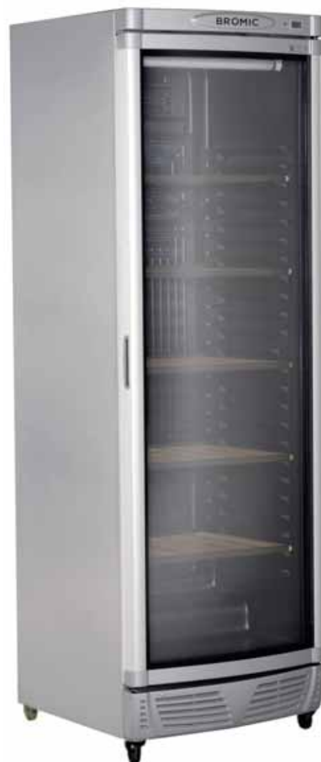
Curved Glass Door Wine Chiller & Preserver WC0400C LED